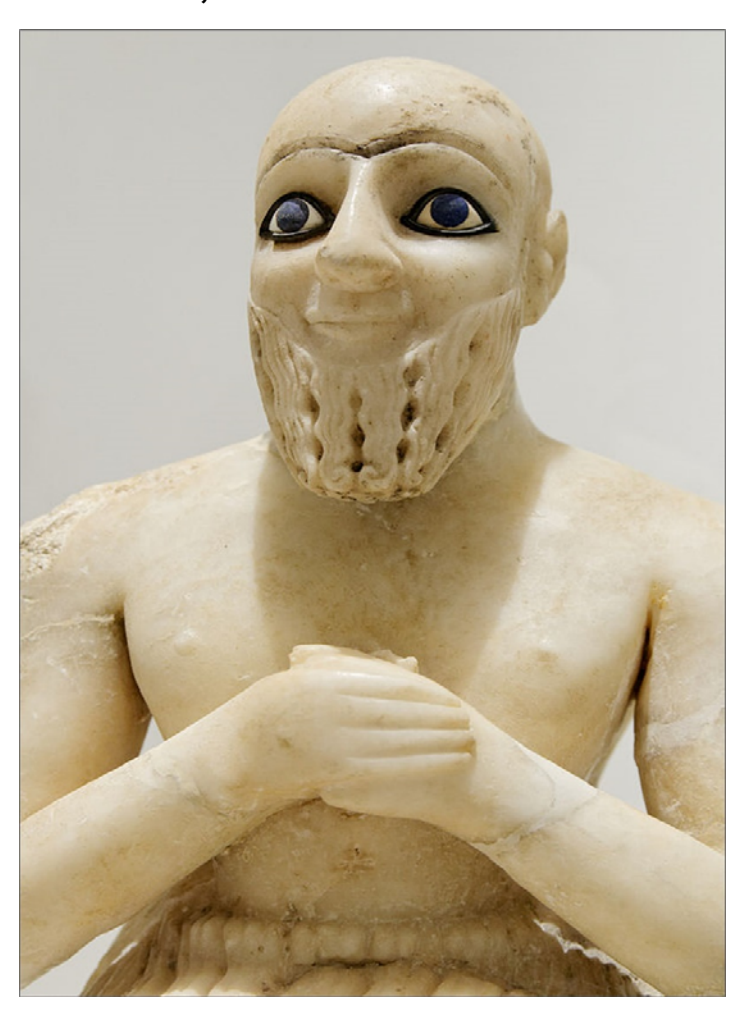
Ebih-II, steward of Mari c. 2500 BCE

The alabaster 52cm high statue from 25th-century BC depicts the praying figure of Ebih-II, steward of the Sumerian city-state of Mari. The statue of perhaps the earliest steward in recorded history, was discovered at the site of the Temple of Ishtar in Mari during excavations between 1933 and 1975. Louvre Museum, item AO17551: Image usage authorised from Wikimedia Commons.